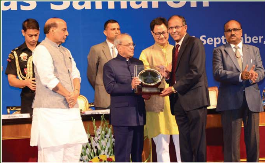
CMD receiving "Rajbhasha Keerti Purashkar" from the President of India

Rashtriya Ispat Nigam Limited, Visakhapatnam Steel Plant In house quarterly newsletter Vol.14 Issue - 1 July - Sept. 2016